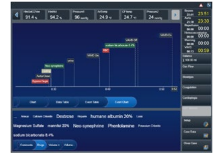
Gas flow chart